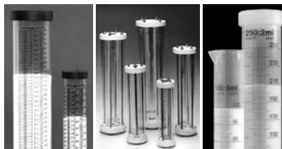
PVC Glass Poly